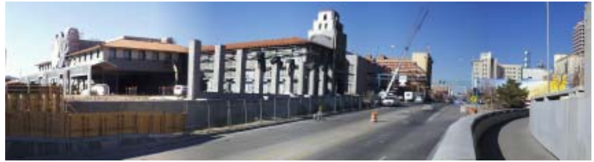
Downtown infill development

This scenario emphasizes higher densities in selected centers and corridors, with a major concentration in the Downtown, University of New Mexico, and Uptown areas to create an employment center sufficient for successful transit. This scenario modifies the land use concept presented in the Transportation Evaluation Study by better balancing population and employment in the Uptown and Central Business District employment centers. The Planned Growth Strategy will test the impact of significant infill in older areas on existing water, sewer, and drainage infrastructure.